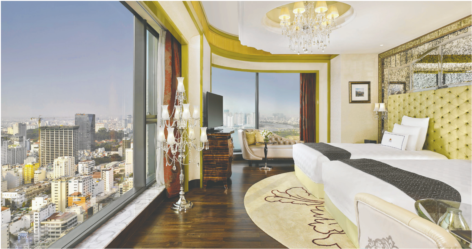
The Reverie Saigon’s rooms offer views of the Saigon River or the Ho Chi Minh City skyline. THE REVERIE SAIGON

no such thing as too much. If you’re up for a celebratory splurge, the hotel can organize a city tour in a limited-edition Rolls-Royce Phantom Dragon with Champagne, or perhaps book a suite attended by a private butler, or a romantic Saigon River cruise at sunset on The Reverie Yacht. The Spa at The Reverie Saigon offers endless ways to luxuriate, including a swimming pool with whirlpools and a children’s pool, saunas and steam rooms, plus services like a Vietnamese massage or a lava foot massage. Posh digs: Even the simplest of the 286 accommodations is an indulgent experience, and not as expensive as it looks. With rates starting at about $380, you’ll be seduced by rich decor and sensational views of the Saigon River or the city skyline. Every room has fine embossed sheets by Frette of Italy, a choice of six pillow types, fresh orchids and a complimentary mini-bar